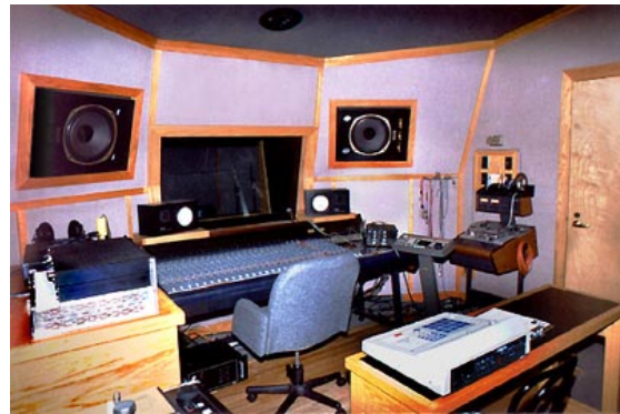
Recording Studio- Learning vocational skills

Barber Shop- Learning vocational skills.